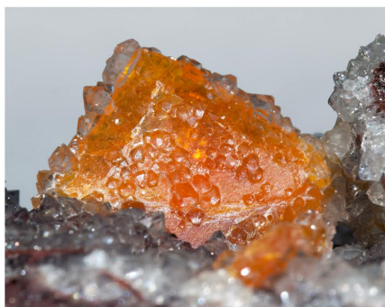
Wulfenite - Mindouli, CONGO Main crystal: 1.5 × 1.1 cm