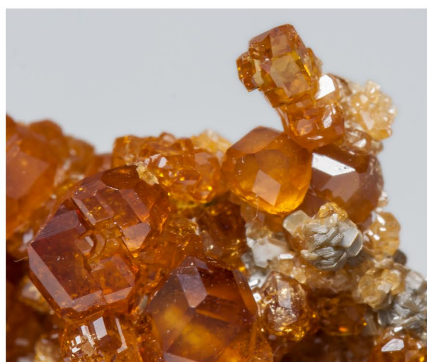
Grossular - Alpe delle Frasse, ITALY Main crystal: 0.4 × 0.3 cm

Hotel TCC - Inn Suites, room 164 Monday, February 2 until Saturday, February 14 (inclusive)