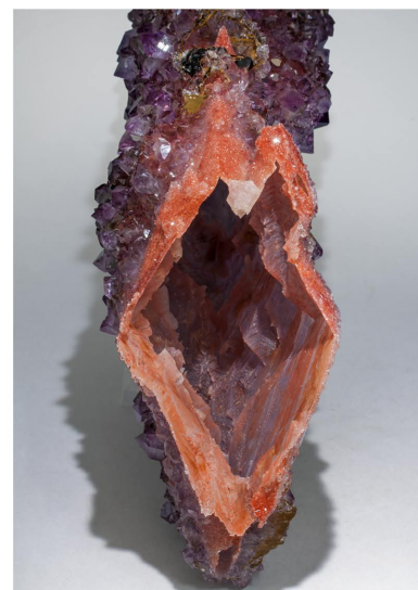
Quartz - Cantera Amarilla, URUGUAY 22.5 × 10.3 cm