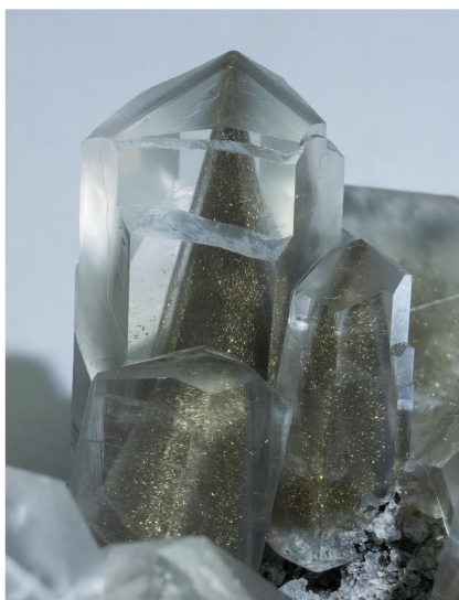
Calcite - Kjørholt, NORWAY Main crystal: 6.3 × 4.2 cm