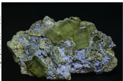
Fluorite & Fluorapatite - Panasqueira, PORTUGAL 8.7 × 5.2 cm