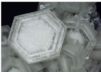
Calcite - St. Andreasberg, GERMANY Main crystal: 1.8 × 1.7 cm