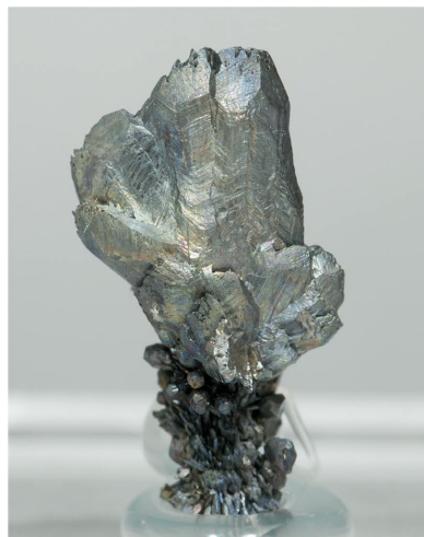
Dyscrasite - St. Andreasberg, GERMANY 1.8 x 0.9 cm.