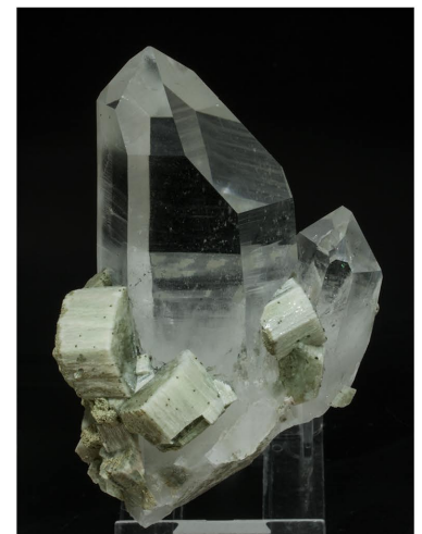
Fluorapatite - Panasqueira, PORTUGAL 9,2 x 6,2 cm.