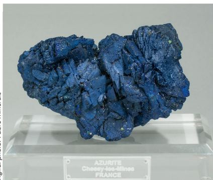
Azurite - Chessy-les-Mines, FRANCE 11 x 7.5 cm.