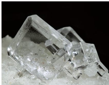
Fluorite - Llamas Quarry, SPAIN Main crystal: 1.3 x 1.1 cm.