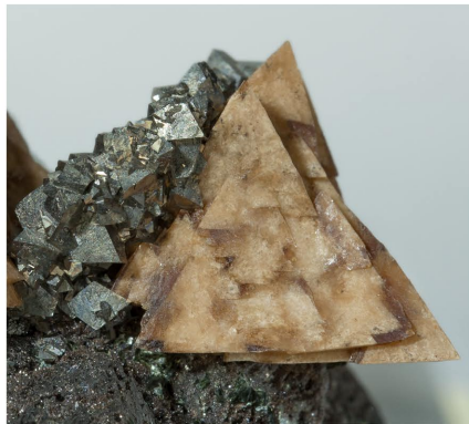
Genthelvite - Huanggang Mine, CHINA Crystals: 1.3 x 1.2 cm.

See you in Tucson or on line through our regular chronicles that as usual will be published at www.mineral-forum.com