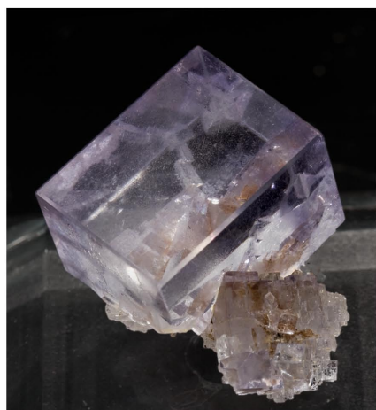
Fluorite - Llamas Quarry, Asturias, SPAIN 2,6 x 1.2 cm.

Open from Tuesday, January 31 until Saturday, February 11 (inclusive)