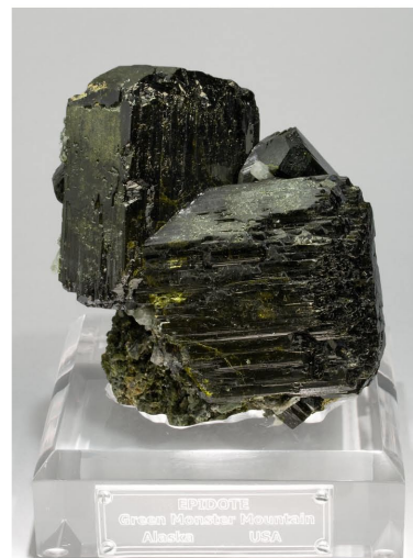
Epidote - Alaska, USA 10.3 x 9.5 cm.