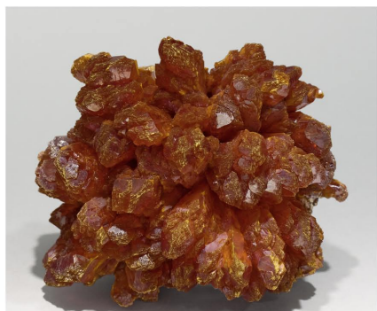
Orpiment - La Libertad Mine, PERU 8,4 x 7.4 cm.