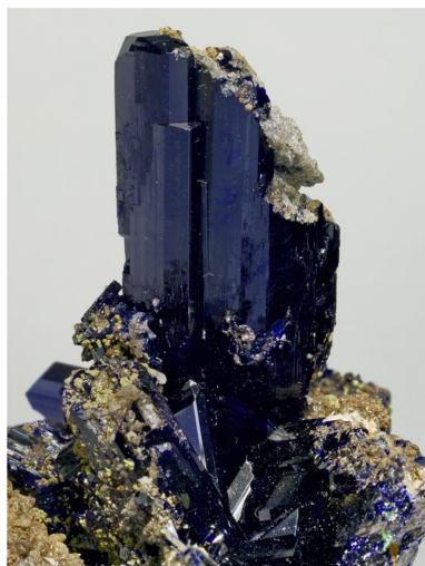
Azurite - Tsumeb, Ex Desmond Sacco 5 x 2.5 cm.