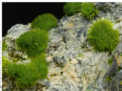
Pyromorphite - Saint Salvy, FRANCE Spec. size: 6.8 x 6.4 cm.