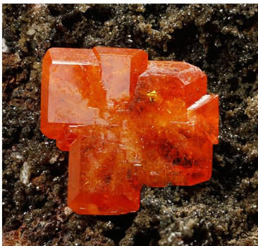
Wulfenite - Red Cloud Mine, USA crystal: 1.6 x 1 cm