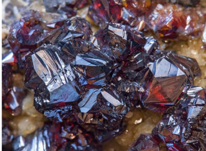
Sphalerite - Troya Mine, Spain crystal: 0.6 x 0.5 cm

Important news! This year we will quit what has been our spot in recent years and we will exhibit in a different way. Where we were before we had the advantage of its great visibility but the inconvenience that it tied me very much and limited me in my purchases because I had to always be there.