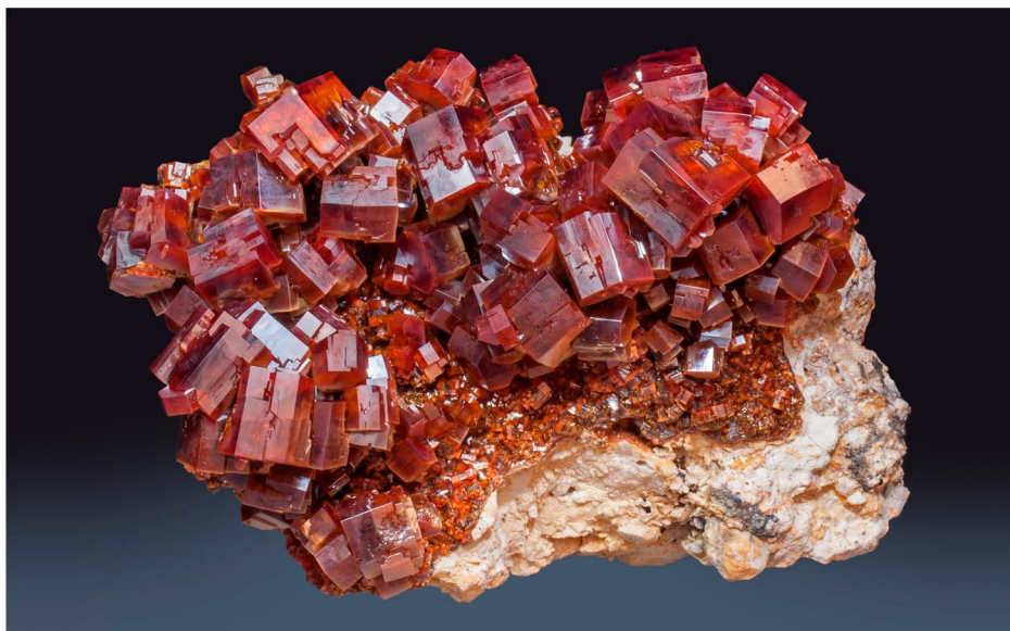
Vanadinite - Mohamedine, Coud'a, Mibladen, MOROCCO