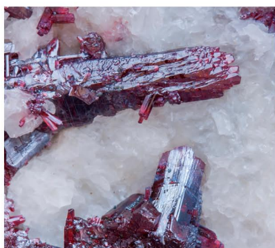
Proustite - Ait Ahmane, MOROCCO Crystal: 1.5 x 0.4 cm