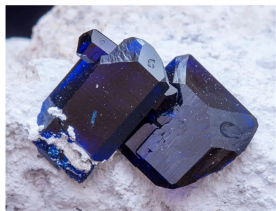
Azurite on Dickite - Milpillas, MEXICO Crystal: 2.1 x 2.1 cm