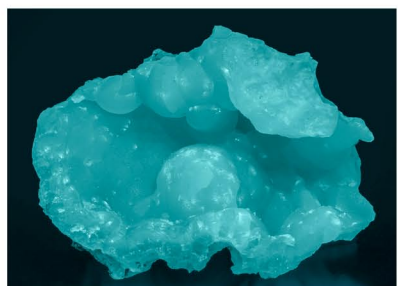
Smithsonite - Kelly Mine, New Mexico, USA 8.7 x 4.7 cm