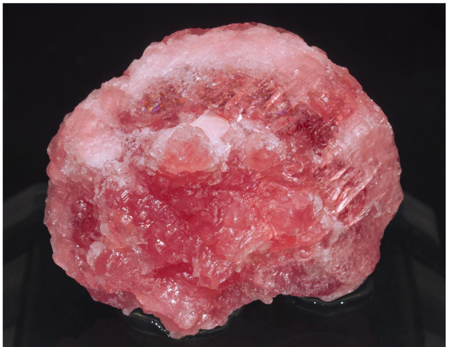
Rhodochrosite - Butte, Montana, USA