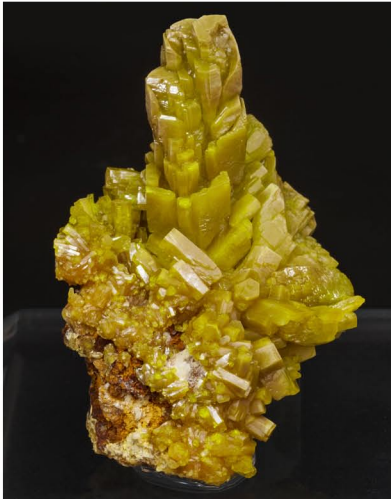
Pyromorphite - Bunker Hill Mine, Idaho, USA 5.1 × 3,7 cm