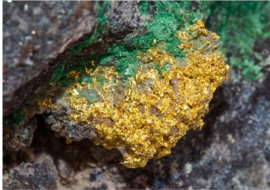
Gold - Bleida Far West Mine, MOROCCO Crystal: 1 × 0,6 cm