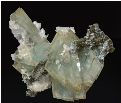
Baryte - Bou Nahas Mine, MOROCCO 8,1 × 7,4 cm