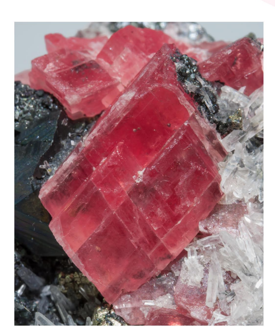
Rhodochrosite - Sweet Home Mine, USA Main crystal: 1.7 × 1.4 cm