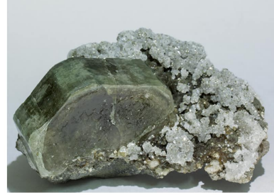
Fluorapatite - Panasqueira