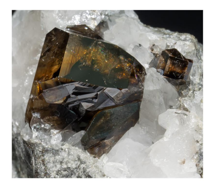
Cassiterite - Amo, CHINA