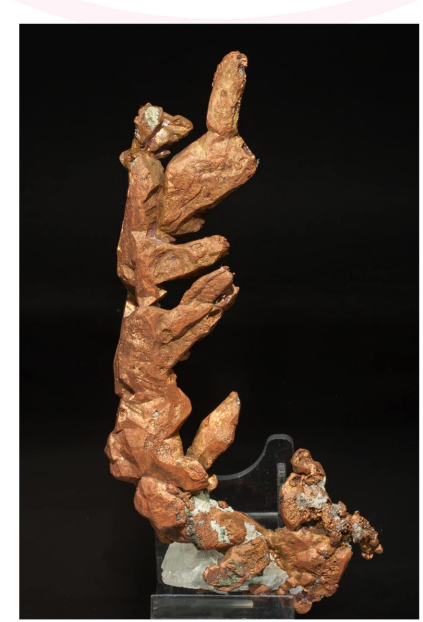
Copper - Keweenaw County, USA