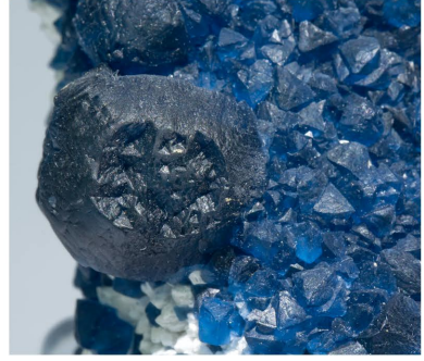
Fluorite - Huanggang, CHINA Main crystal: 1.6 × 1.4 cm