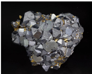
Galena - Dalnegorsk, RUSSIA 10.8 x 9 cm.