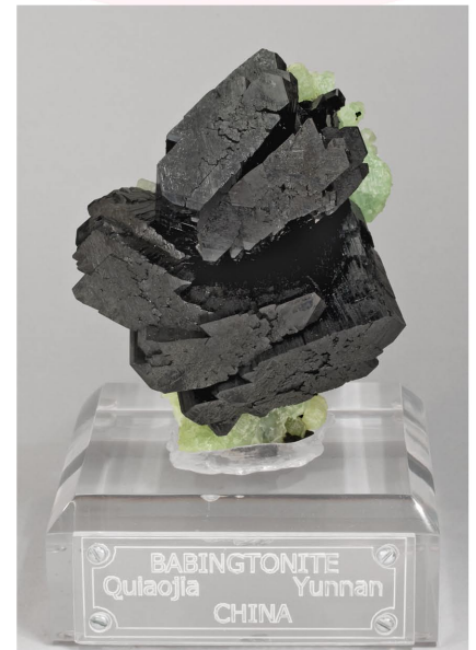
Babingtonite - Qiaojia, CHINA 9.8 x 6.8 cm.