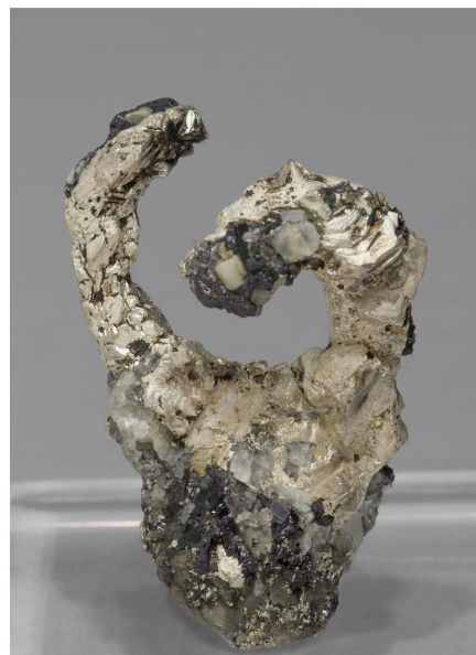
Silver - Kongsberg, NORWAY 3.4 x 2.2 cm.