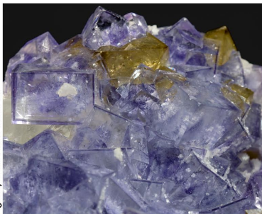
Fluorite - Yaogangxian Mine, CHINA 8.4 x 6.7 cm.