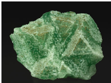
Fluorite - El Hamman, MOROCCO 7.7 x 5.8 cm.