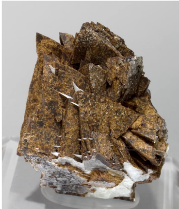
Helvite - Huanggang Mine, CHINA 4.8 x 4.1 cm.