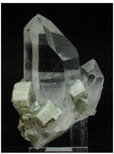
Fluorapatite - Panasqueira, PORTUGAL 9,2 x 6.2 cm.