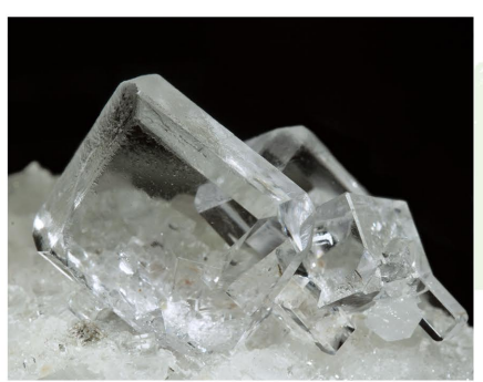
Fluorite - Llamas Quarry, SPAIN Main crystal: 1.3 x 1.1 cm