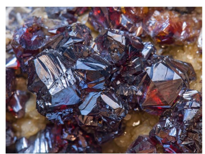
Sphalerite - Troya Mine, Spain