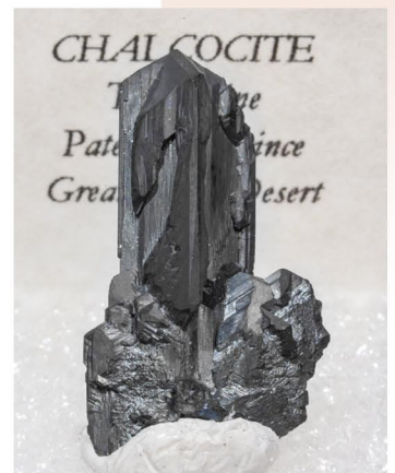
Chalcocite - Telfer Mine, Australia 2.6 x 1.5 cm