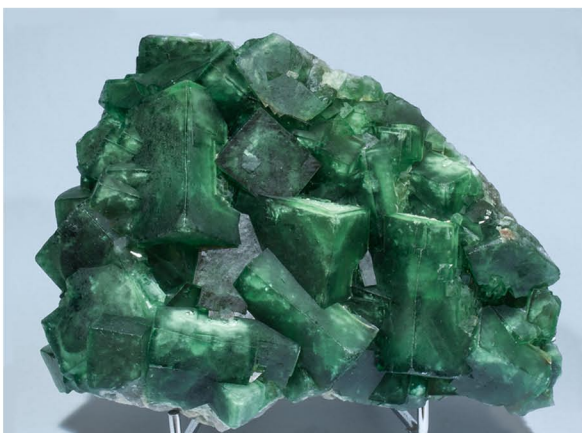
Fluorite - Malaimbandy area, Madagascar 15.8 x 12.4 cm