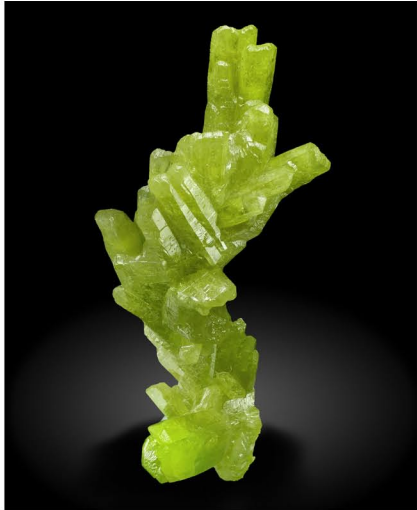
Pyromorphite - Daoping Mine, Guilin, China 4.9 x 2 cm