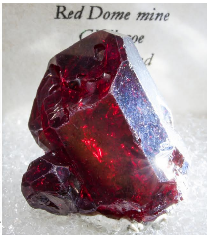
Cuprite - Red Dome Mine, Australia 2.5 x 2 cm