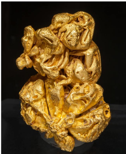
Gold - Serra Dourada, Brazil 3.6 x 2.6 cm