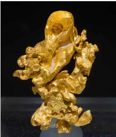
Gold - Zapata claims, Venezuela 3 x 1.9 cm

Vertical text: Digital photo & design: Fabre Minerals