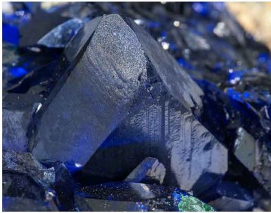
Azurite - Chessy, France Main crystal: 1.8 x 1.4 cm