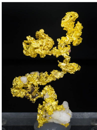
Gold - CHINA 4.8 x 2.9 x 1.4 cm