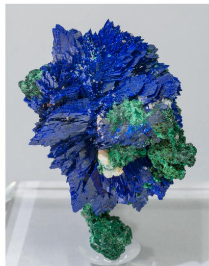
Azurite - Oumjrane, MOROCCO 5.8 x 3.6 x 3.5 cm