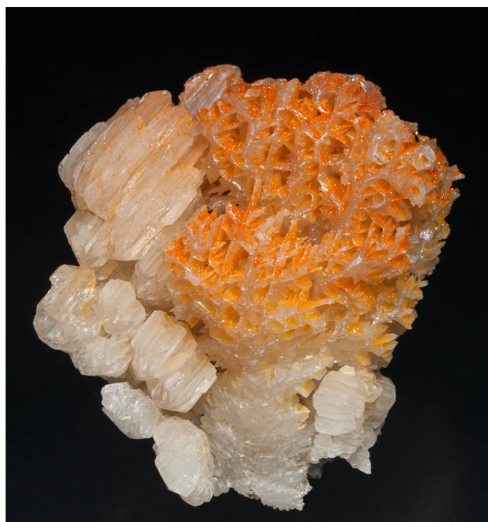
Mimetite on Cerussite - Nakhlak Mine, IRAN 4.9 x 4 x 3.1 cm