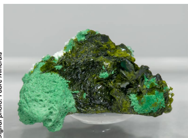
Volborthite - Milpillas Mine, MEXICO 1.3 x 1 x 0.9 cm